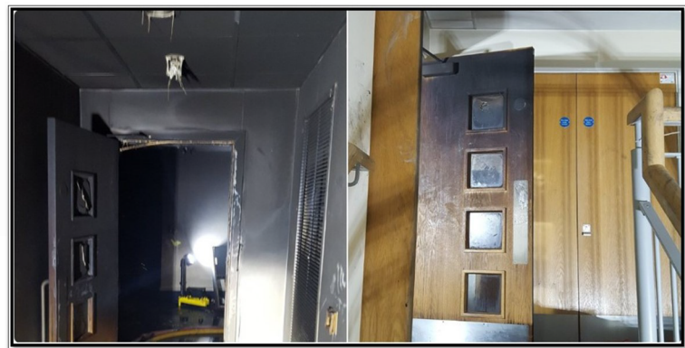
An image of a fire door having done its job

We can visit your property on a six-monthly basis, complete the checks and provide you with a comprehensive report ensuring that your property is compliant and advise you of any issues.